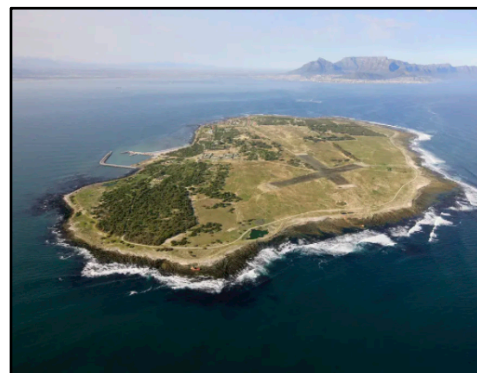
Robben Island Penal Colony

Please Complete this Form and Mail with Payment to New York Address Below