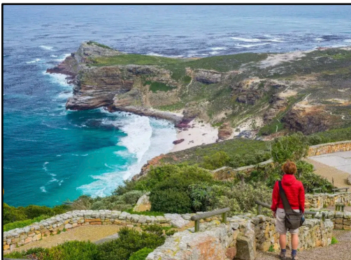
Cape of Good Hope